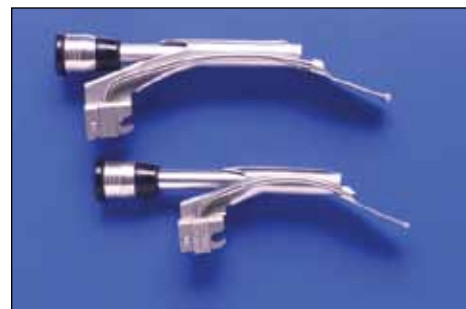
Figure 2. ViewMax

The LMA is an alternative airway device used for anesthesia and airway support. It consists of an inflatable silicone mask and rubber connecting tube. This device was the first supraglottic airway that became regularly used in clinical practice. It is a useful device because it allows rapid airway access for spontaneous or controlled ventilation and does not re-